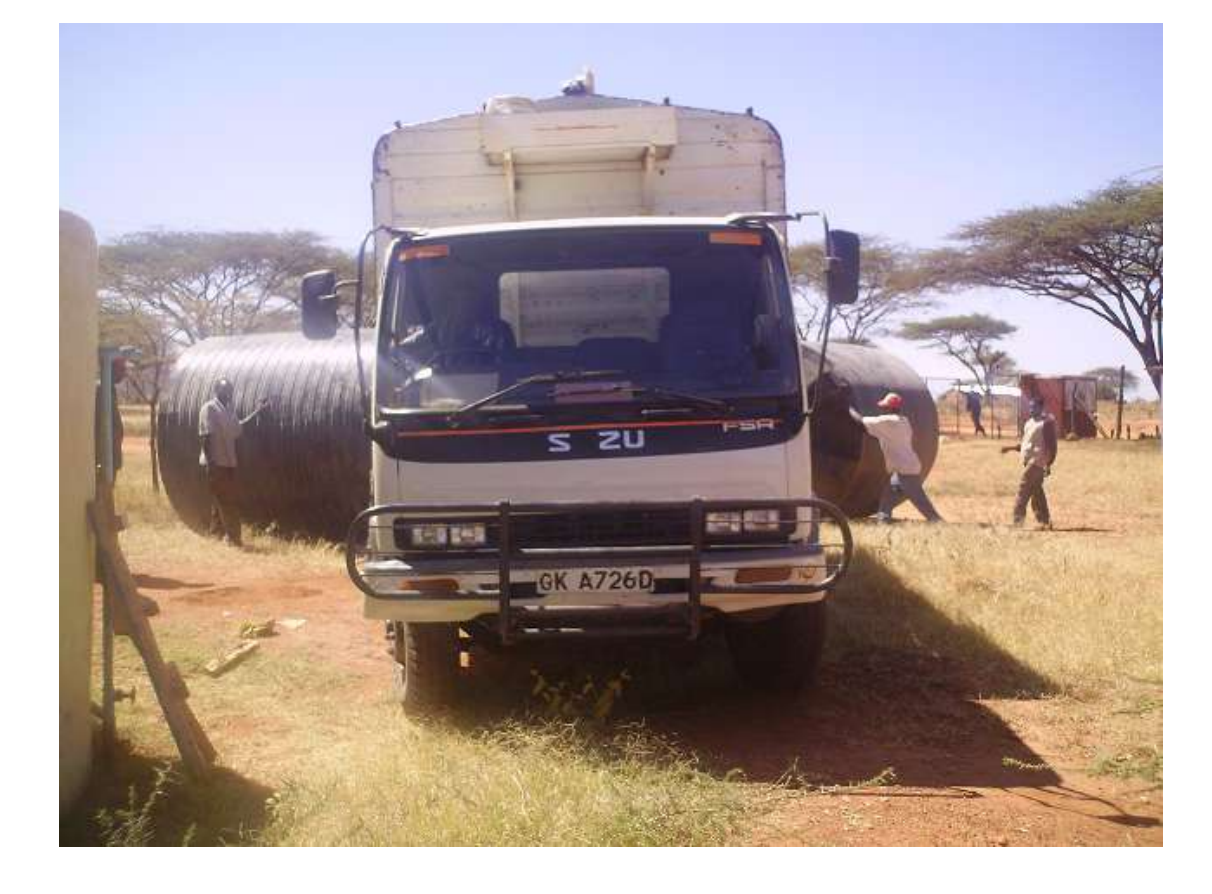
Off loading of water tanks in Wamba Secondary School from a G.K. lorry from Arid lands resource management project who facilitated transportation of the tanks by providing the lorry.