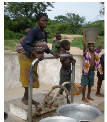
A water well similar to the ones we have placed in Ghana