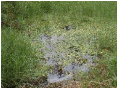
Previous drinking water hole in Ghana, Africa

We are still looking for partners in the water well ministry for villages in Ghana & Kenya. If you or your church would like to help place a water well in honor or in memory of a loved one, we can help you give a gift that will keep on giving in Jesus' name.