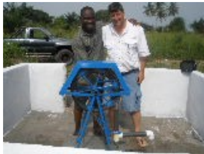
New functioning water well! Praise God!