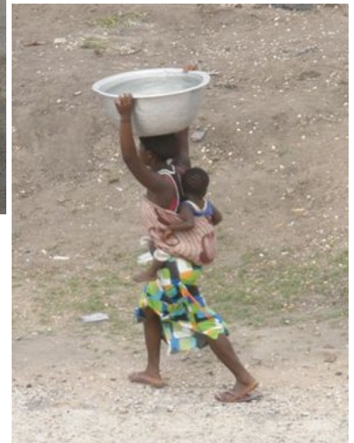
Water worth walking for!

Copyright © 2009 Unto the Least of His. All rights reserved. No part of this publication may be reproduced, stored in a retrieval system, or transmitted, in any form or by any means, without the prior written permission of the publisher.