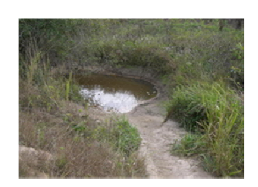
Future location for water well in Ghana, Africa

Contact Info: Bobby Gale, Director bobby@totheleast.com