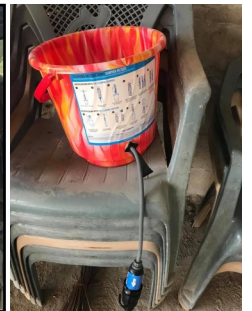
Operation Clean Water in process from Coast for Christ and Unto the Least of His.

The church buildings may be suspended for a season but the church is alive and well. These beautiful children just received new dresses in Central America. Thank you God for the harvest and the laborers who are making a difference in the world!