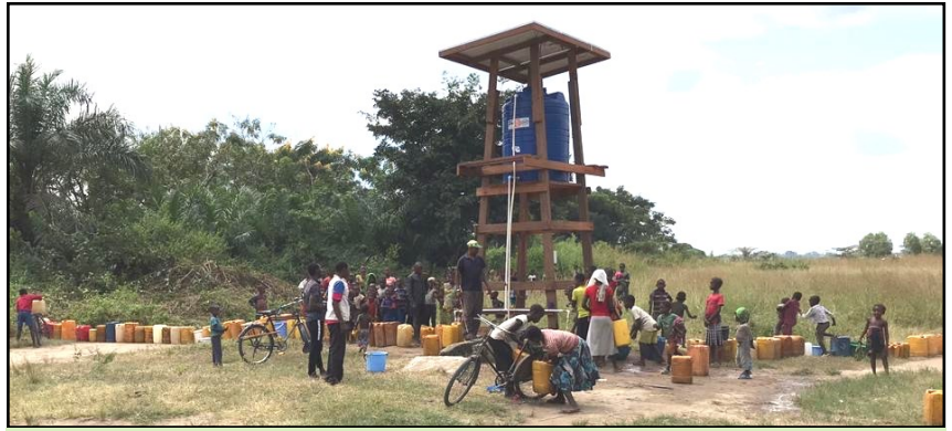
Dozens of women line up for pure healthy water being pumped from 100 feet below their village by solar panels and a solar pump!!