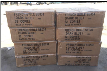
Boxes of Bibles being loaded on a riverboat in Kinshasa that should depart this week! 450 Bibles for students in Lodja!