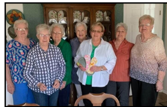
Our goal of making 4200 reusable menstrual pads for young girls in the African schools is getting closer! Thank you to all who have worked so hard to make this happen.