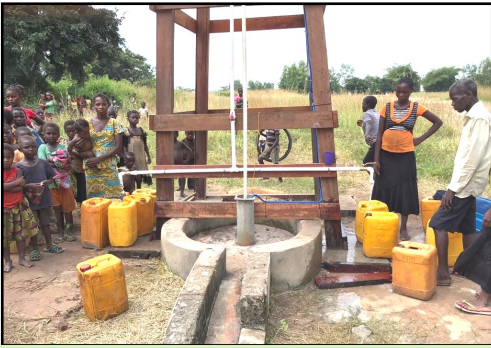
Two pipes with spigots to serve twice as many people!